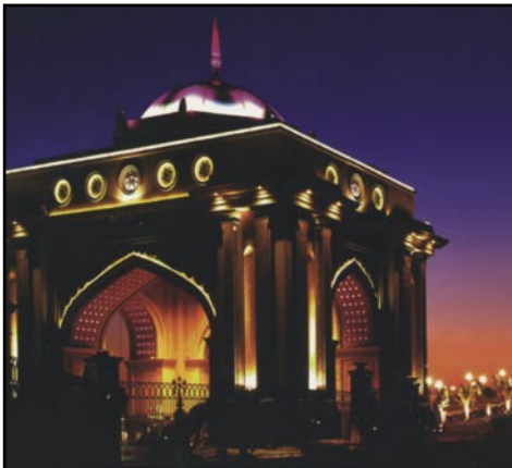
Abu Dhabi by night