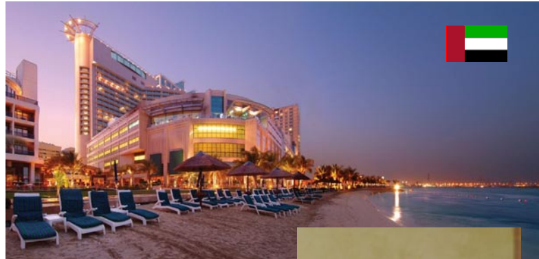
Beach Rotana Hotel & Towers

The Citizen ID Forum is the world's most comprehensive event on secure ID documents. It discusses the progressive digitalization of Passports, National IDs, Driver's Licences, Health Cards, Visas and 'Green Cards', as well as the future of Smart Tickets and Payment Systems.