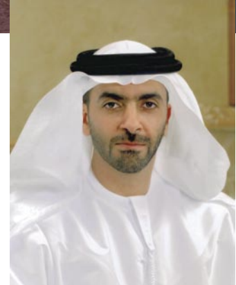
H.H. Major General Sheik Saif bin Al Nahyan, Minister of Interior of the UAE